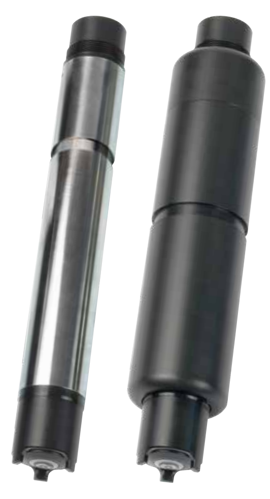
top left: TriOxmatic® 700 IQ; top right: seawater model TriOxmatic® 700 IQ SW

left: scheme of the TriOxmatic® 3 electrode system: gold cathode (A), counter electrode (G, silver) and reference electrode (R, silver); right: membrane cap and protective cap